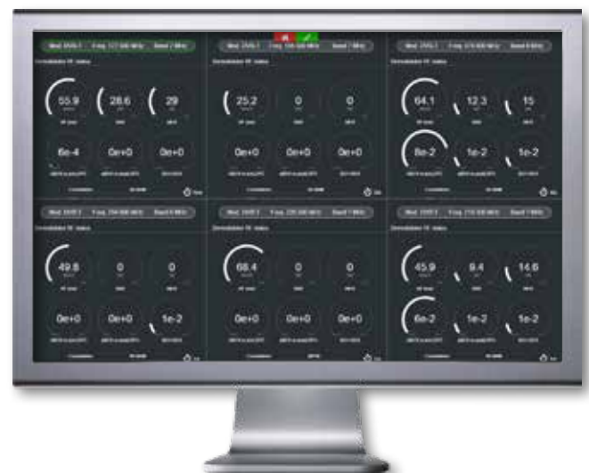
It scans the network at the selected frequencies in any modulation in round-robin.