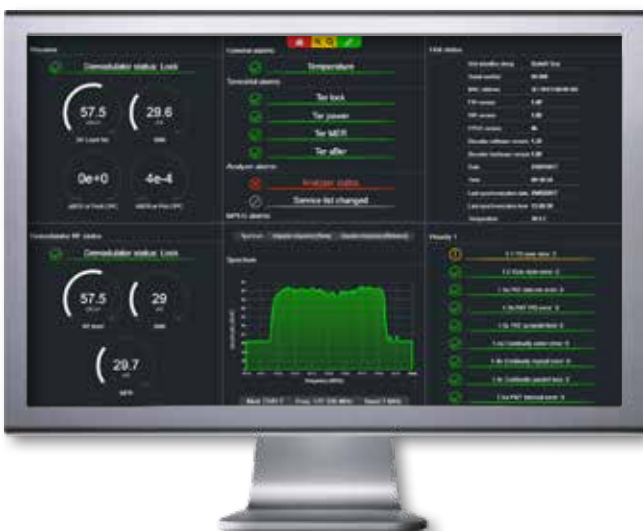
The Mosaic allow to analyze up to 6 measures screens on the same display.