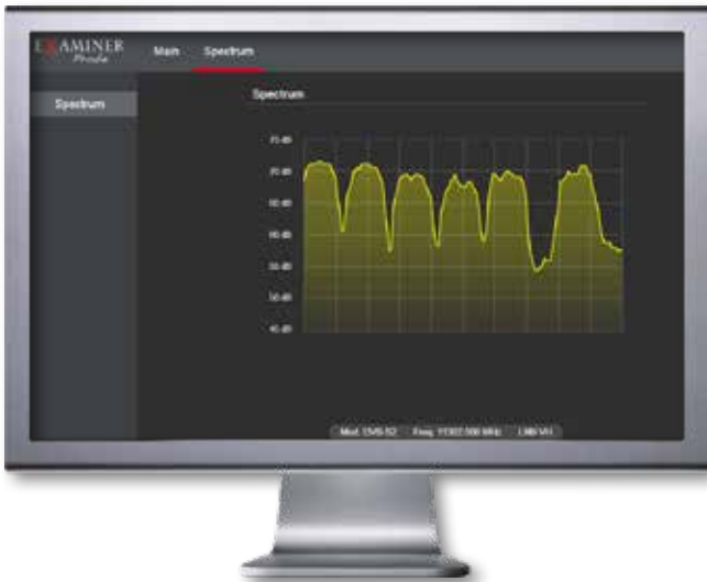
Spectrum analysis with selectable SPAN.