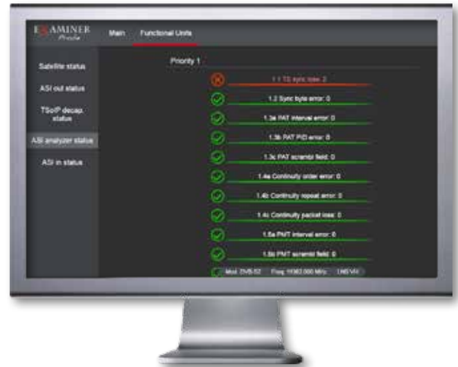
T.S. Analyzer ETR 101-290.