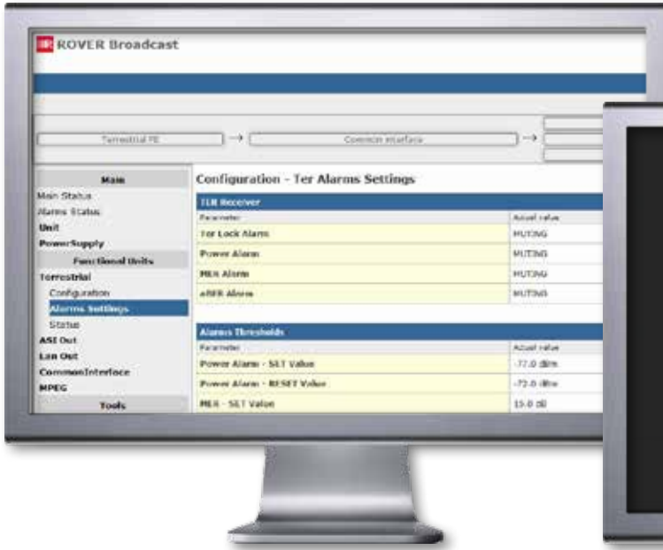
Professional Set-up and Logger.