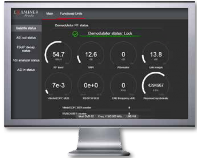
Parameters and measures.