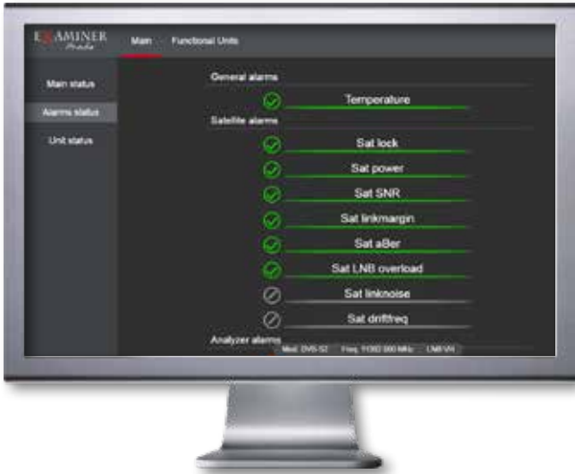
General status with the main alarms in one screen.